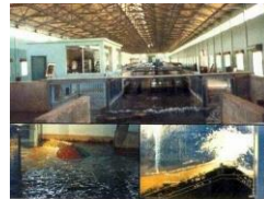
Random Sea Wave Generation